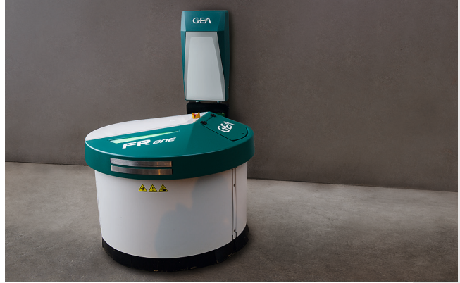
The GEA FRone returns to its charging station automatically and can leave the station either forwards or backwards.